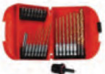
Drill Bit Set (5/32", 1/2", 1/4")