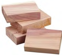
Wood Blocks (optional)