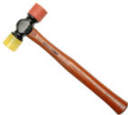
Deadblow Unicast Hammer