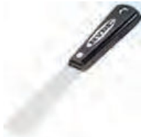
Putty Knife (optional)