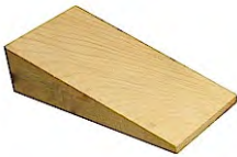
Wood Wedges (optional)