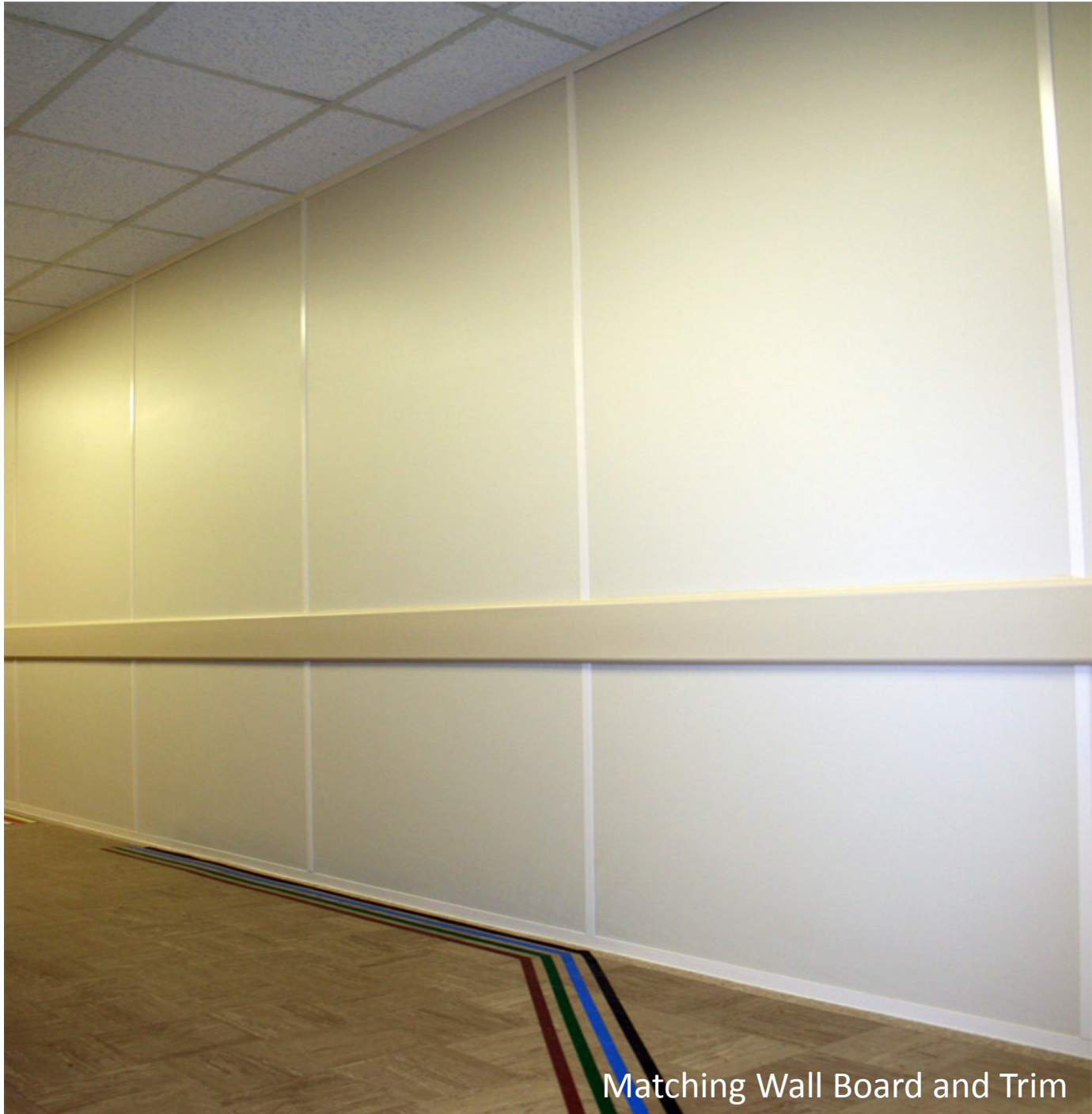
Matching Wall Board and Trim