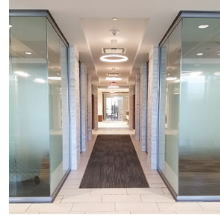
NxtWall Delivers an Impressive View...