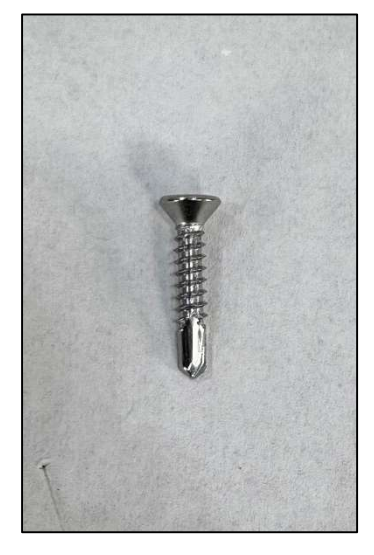
1" Anchoring Screw