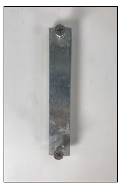
Glass Door Backing Plate